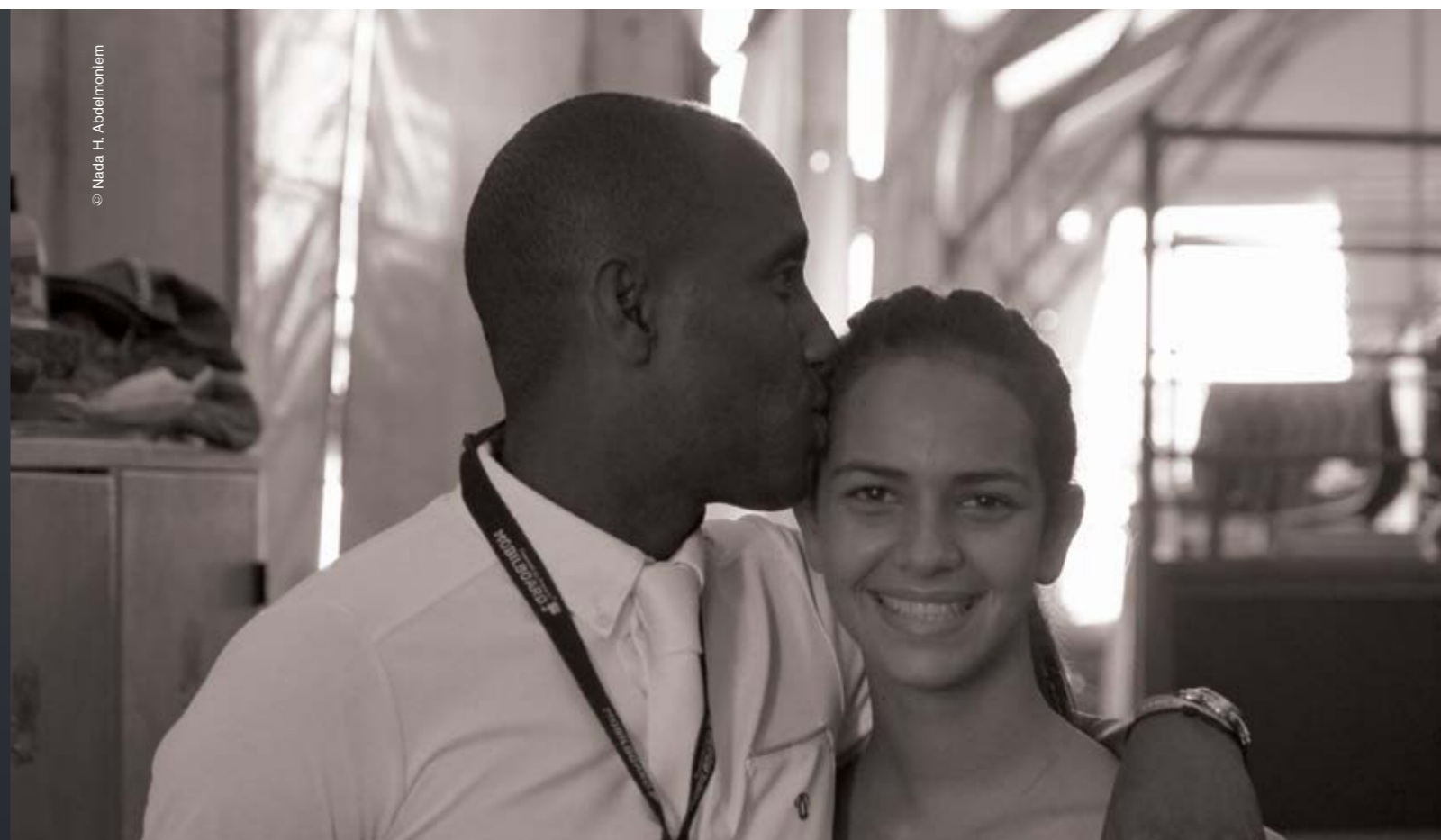
At the 2012 GCT in Monaco