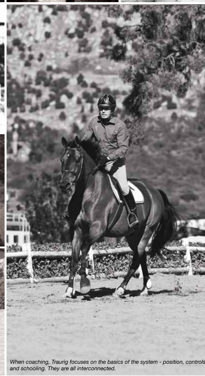
When coaching, Traurig focuses on the basics of the system - position, controls, and schooling. They are all interconnected.