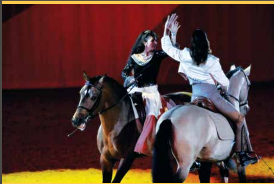
▲ Camargue horses with La Montagnette

The UNESCO nomination for Equitation in the French tradition stated: