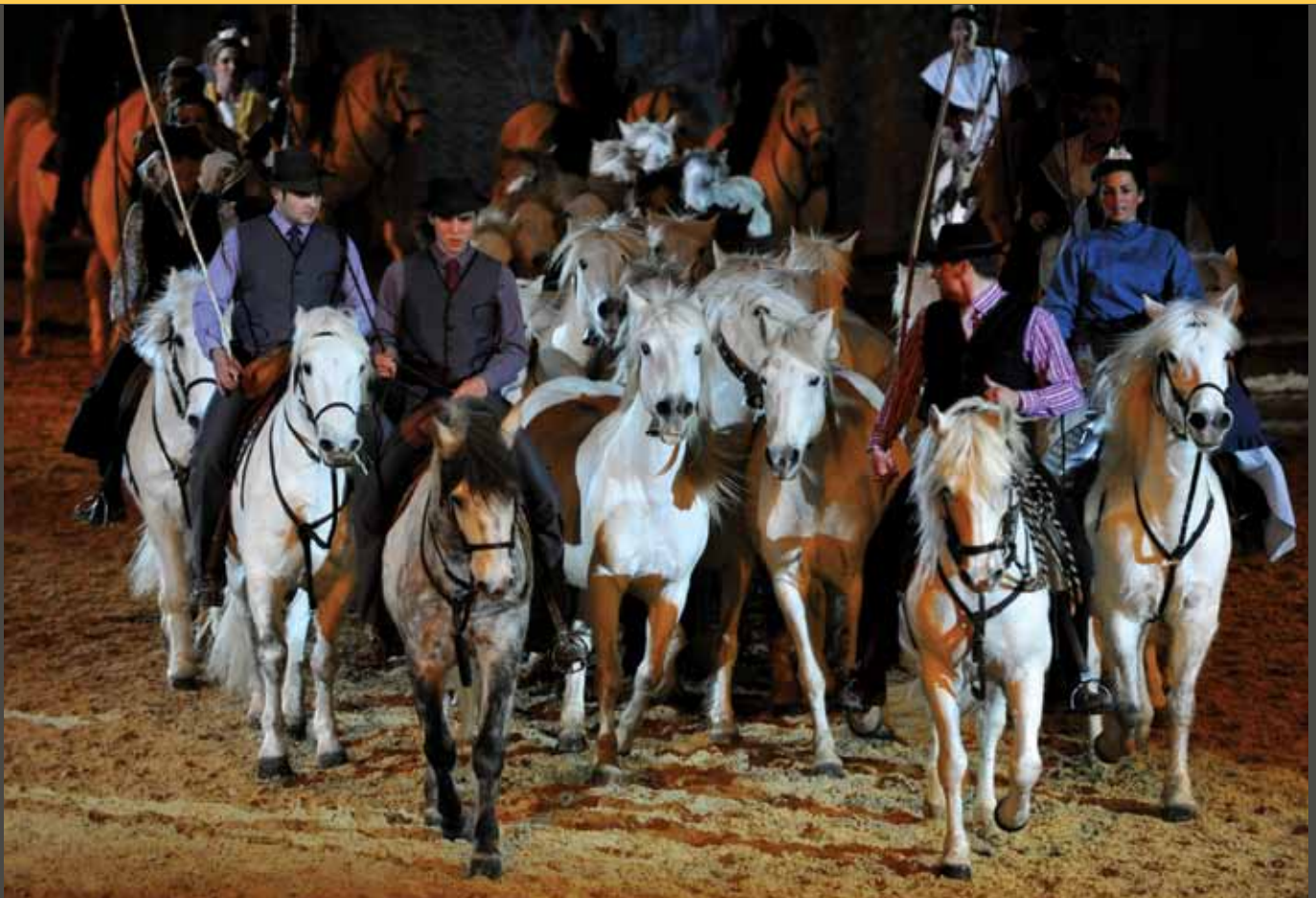
▲ Horses from the Maremma

AN ANNUAL EVENT FOR US IS TO MAKE THE JOURNEY UP FROM OUR LITTLE FISHING VILLAGE ON THE MEDITERRANEAN TO AVIGNON IN JANUARY TO ATTEND WHAT THE ORGANISERS CALL 'UN RENDEZVOUS EQUESTRE ECLECTIQUE ET CONVIVIAL'; AND THERE IS REALLY NO OTHER WAY TO DESCRIBE THE EVENT. FOR THE PAST 30 YEARS CHEVAL PASSION, A HORSE EXTRAVAGANZA AND EXHIBITION WHICH PAYS TRIBUTE TO 'L'EQUITATION DE TRADITION FRANCAISE', OR EQUITATION IN THE FRENCH TRADITION, HAS BEEN HELD IN AVIGNON. THE EVENT CATERS TO THE DELIGHT OF YOUNG AND OLD, WESTERN AND CLASSICAL, PERFORMERS AND AUDIENCE, SPECIALTY BREEDERS AND BUYERS, AND EXHIBITORS.