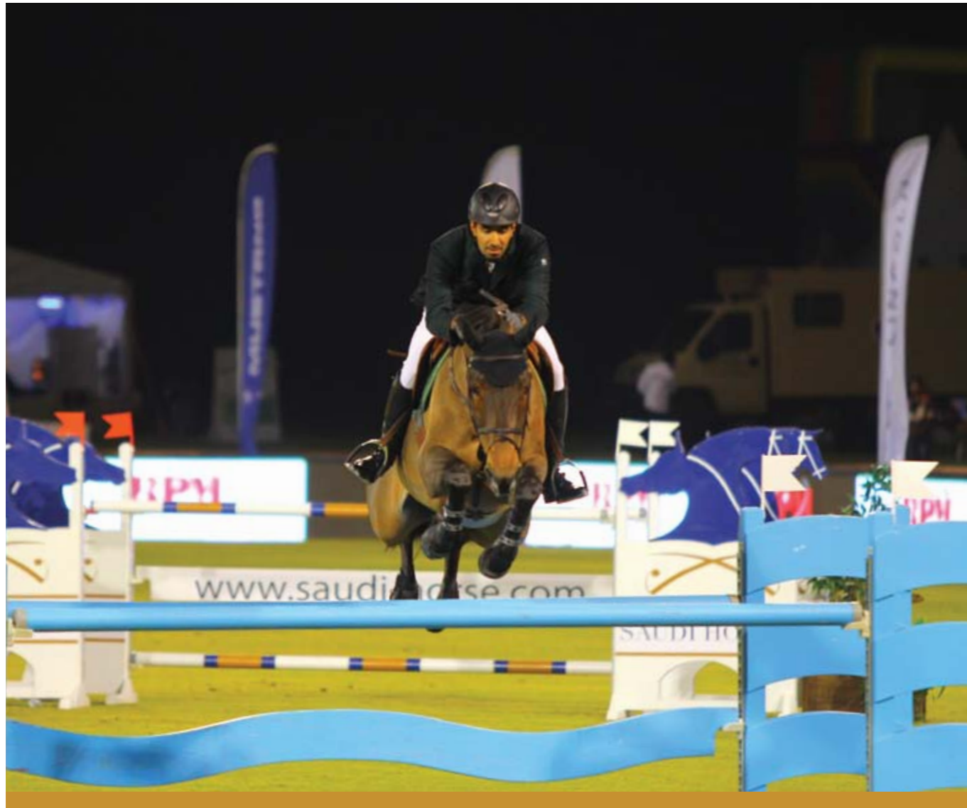
HRH Prince Abdullah bin Miteb