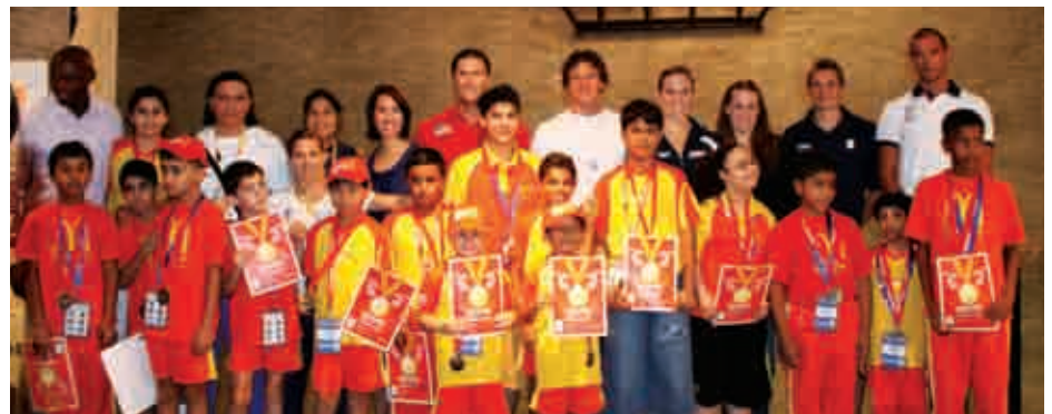
▲ McDonald's Champion Kids

Aiming to educate the children in Egypt about the Olympic Games and adhering to its commitment to promote active lifestyles, McDonald's Egypt launched the Champion Kids programme.