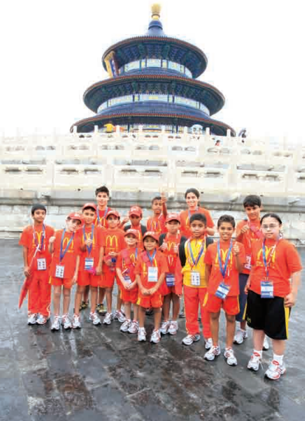
▲ McDonald's Champion Kids