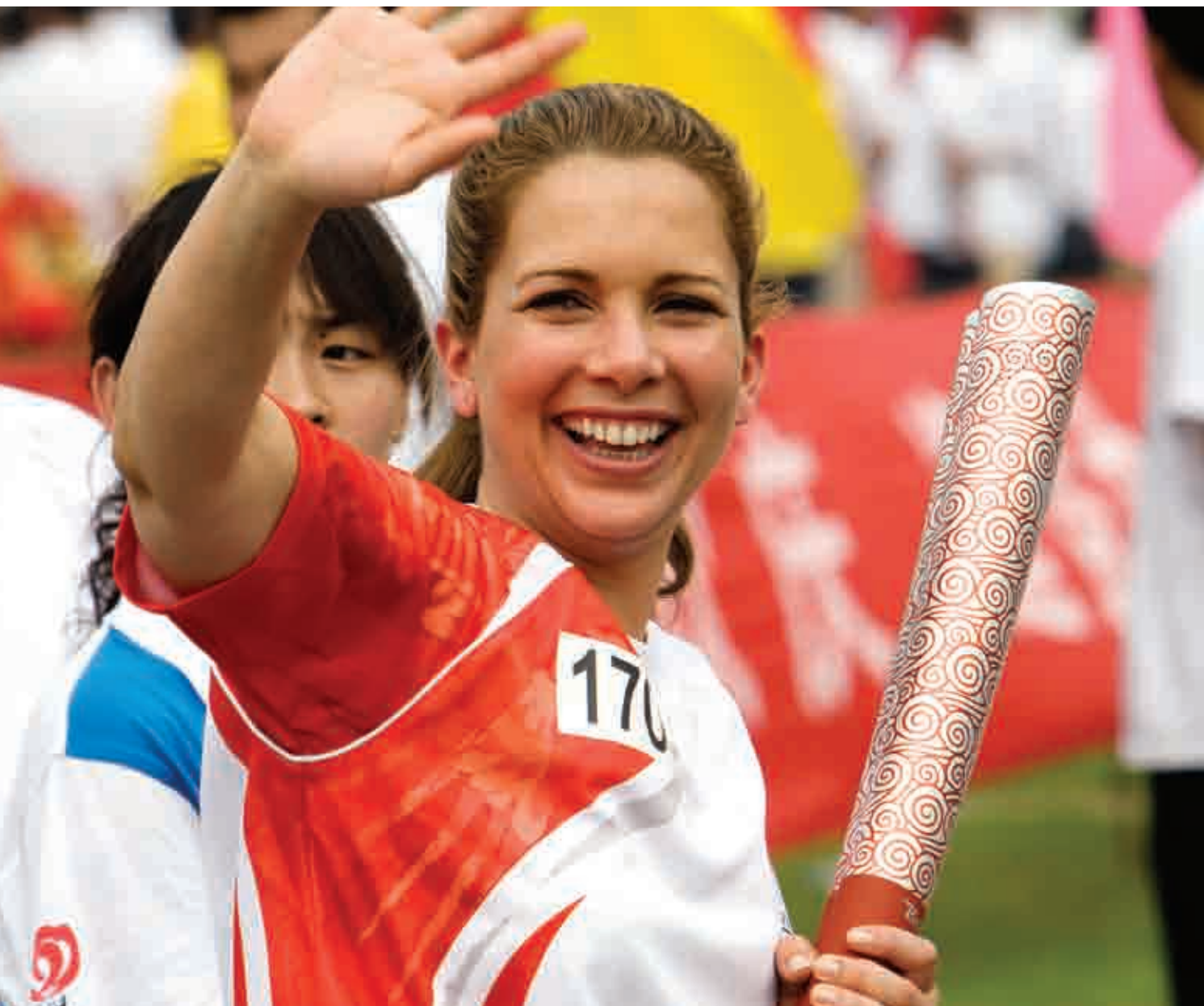
▲ HRH Princess Haya, who is an IOC Member, taking part in the Torch Relay at the Beijing Olympic Games

stands before and after their competitions.