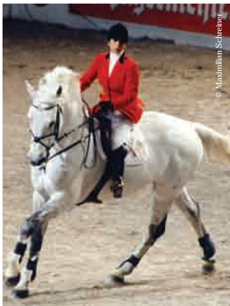
▼ HRH Princess Haya riding Come On, Frankfurt 1998

need them to come with us on that journey and in the end we must ensure that athletes understand that they are the people responsible for the animals that they ride and that the welfare of the horse is the most important aspect of the sport.