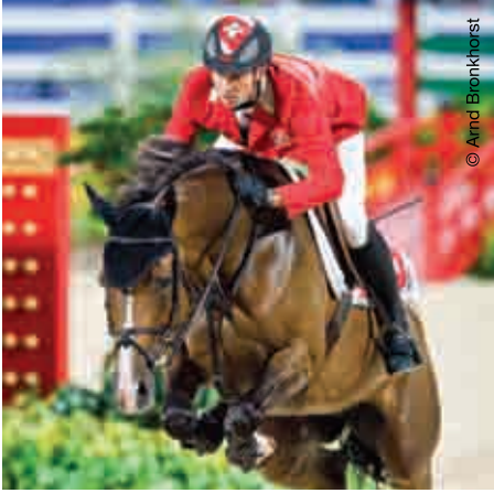
▲ Steve Guerdat, Switzerland