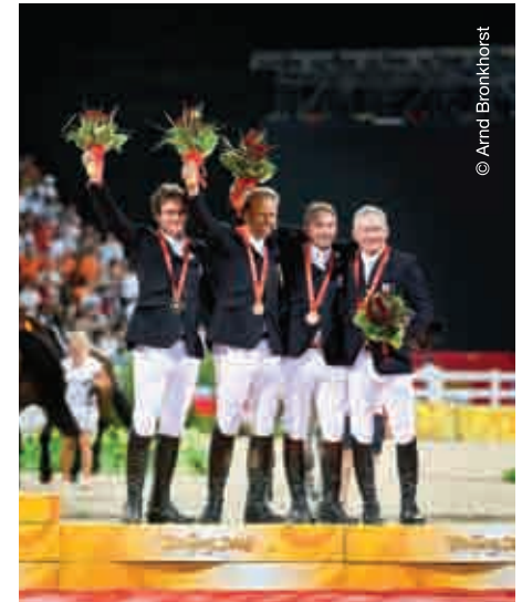
▲ Norway, Team bronze