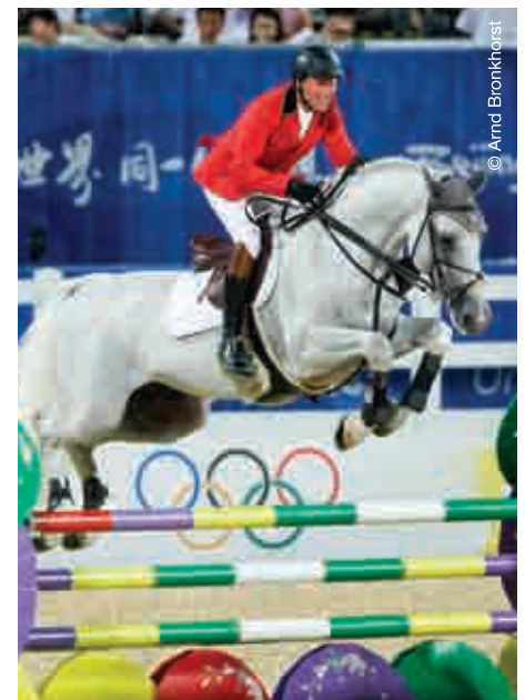
▼ Jos Lansink, Belgium

2001 Jos became a citizen of Belgium, for which he competed at the 2004 Athens Olympics. Jos won the gold medal in the 2006 FEI Aachen World Equestrian Games riding Cavalor Cumano and is currently the World Champion.