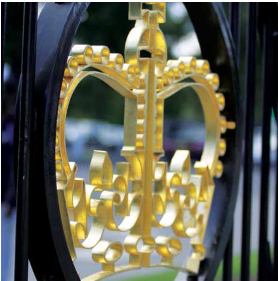
▲ The gates with their royal insignia

focus at all, with the attention on the attendees, the Queen and of course, what everyone is wearing!