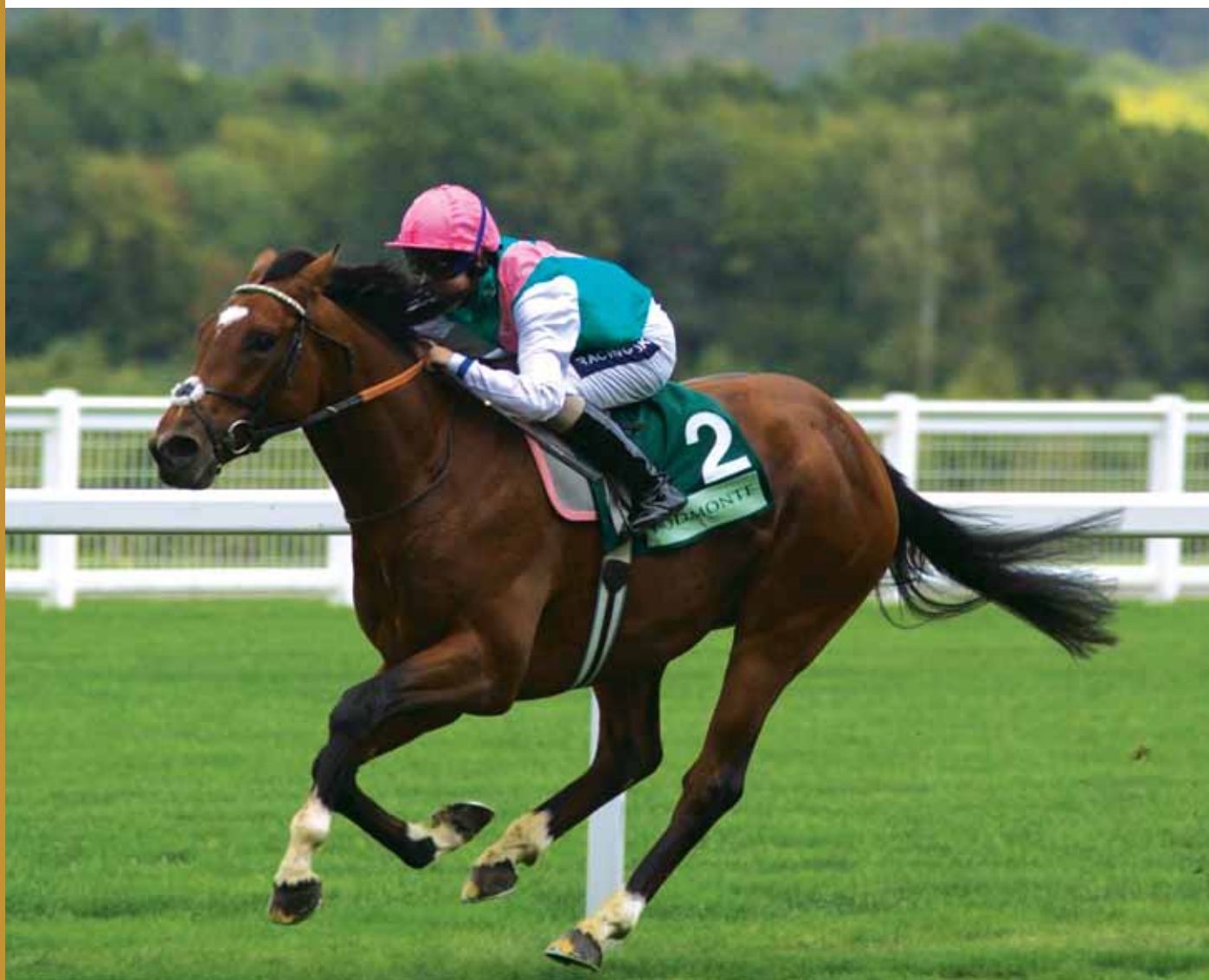
▲ Frankel leads the way in the St James Palace Stakes