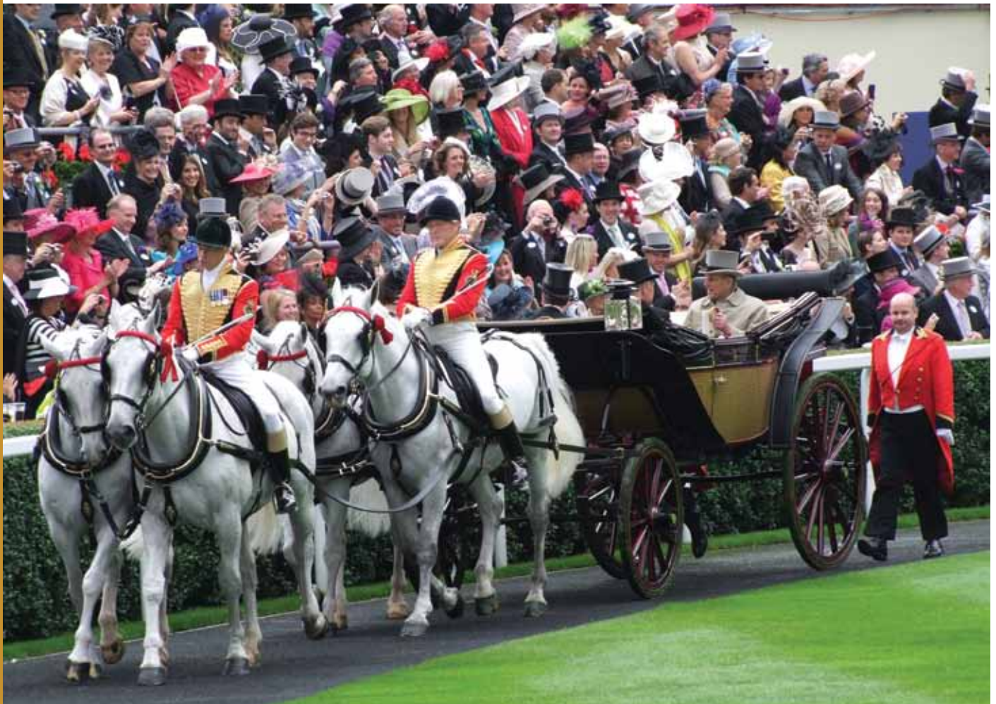
▲ The Royal Procession enters a packed Winners Enclosure

millions of pounds of horse flesh, straining every muscle and sinew to get first past the post in a series of championship level events. In any year, for aficionados, the racing at Royal Ascot is a mouthwatering week of the best that the sport can offer but 2011 was special even by Ascot's high standards. Champions of France, USA, Ireland, Hungary and Australia amongst others were lining up for glory. There were runners trained in the UAE and others owned by the Chinese. And the British were hoping that the newly knighted Sir Henry Cecil would celebrate his freshly awarded honour by getting the week off to a flying start when the so far unbeaten and amazing three year old Frankel ran for him in the colours of Prince Khaled Abdullah. The horse who galloped away with the 2000 Guineas let no-one down