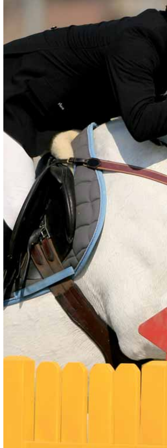
▲ Shadi Gharib