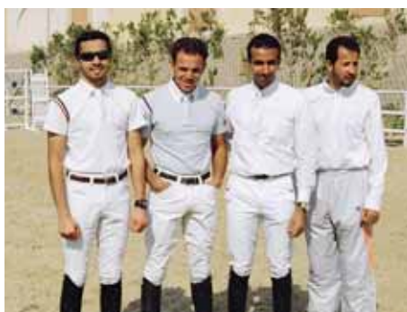
▲ HRH Prince Faisal, Abdallah, HRH Prince Abdullah & Khaled Al Eid

◀ ▼ HRH Prince Abdullah bin Meteb Al Seoud (Individual Gold medallist)