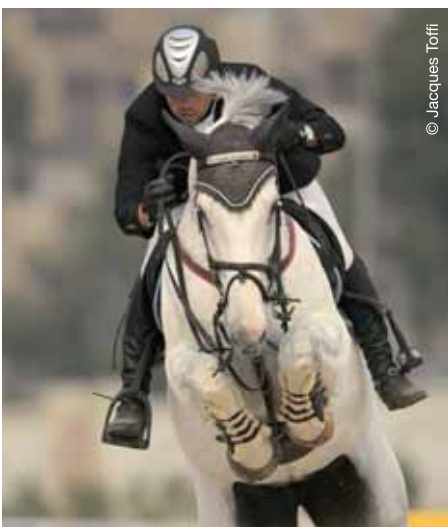
▲ Shadi Gharib