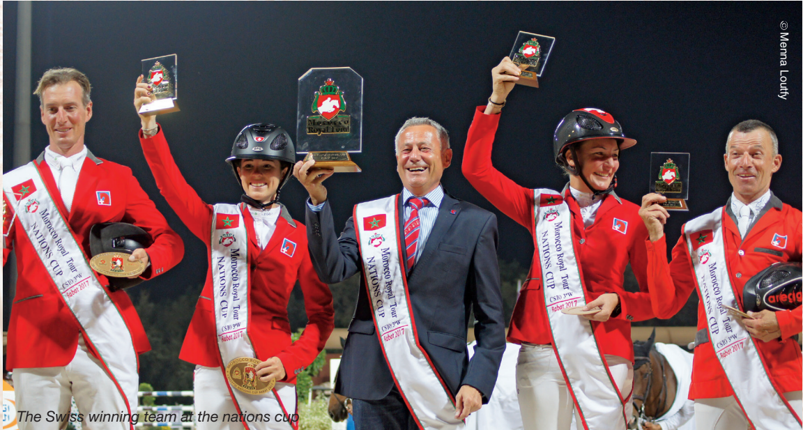
The Swiss winning team at the nations cup