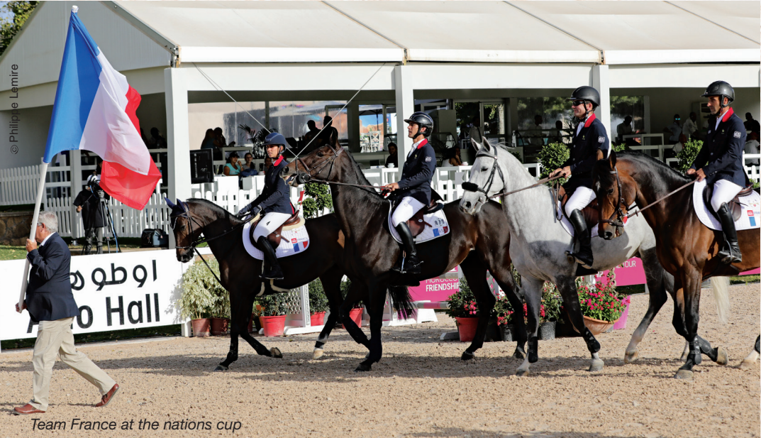
Team France at the nations cup