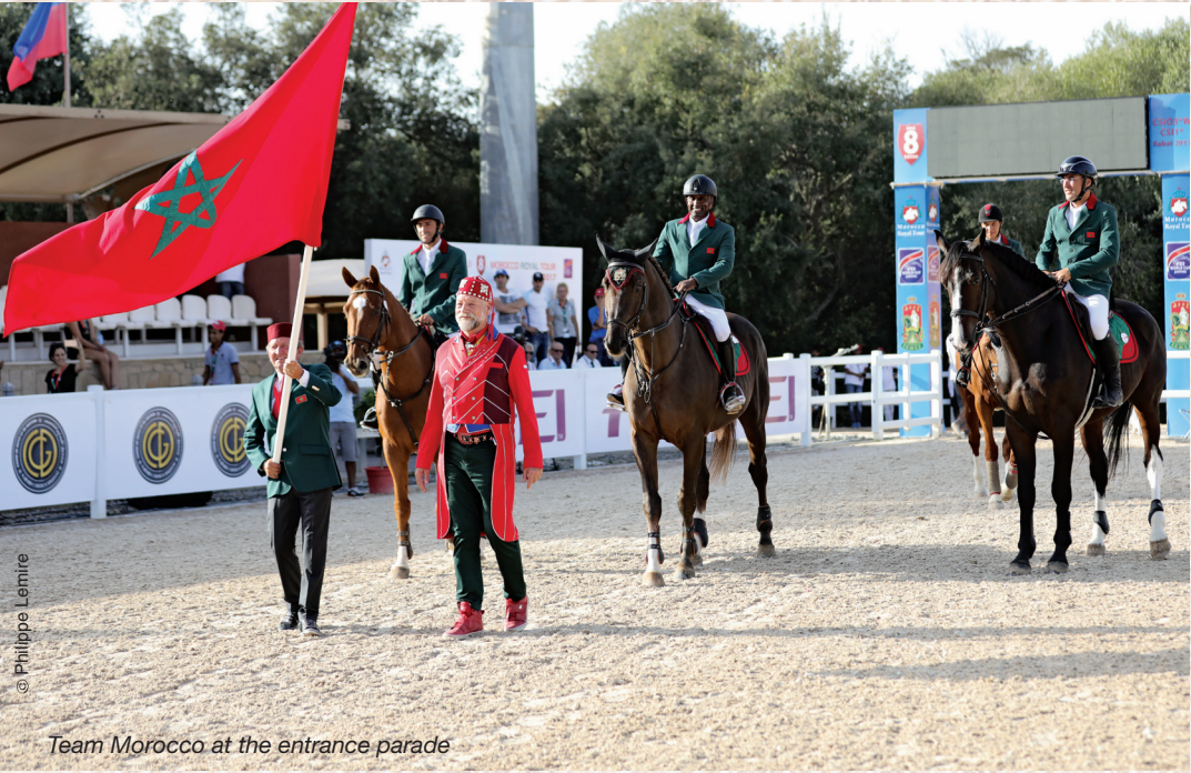
Team Morocco at the entrance parade