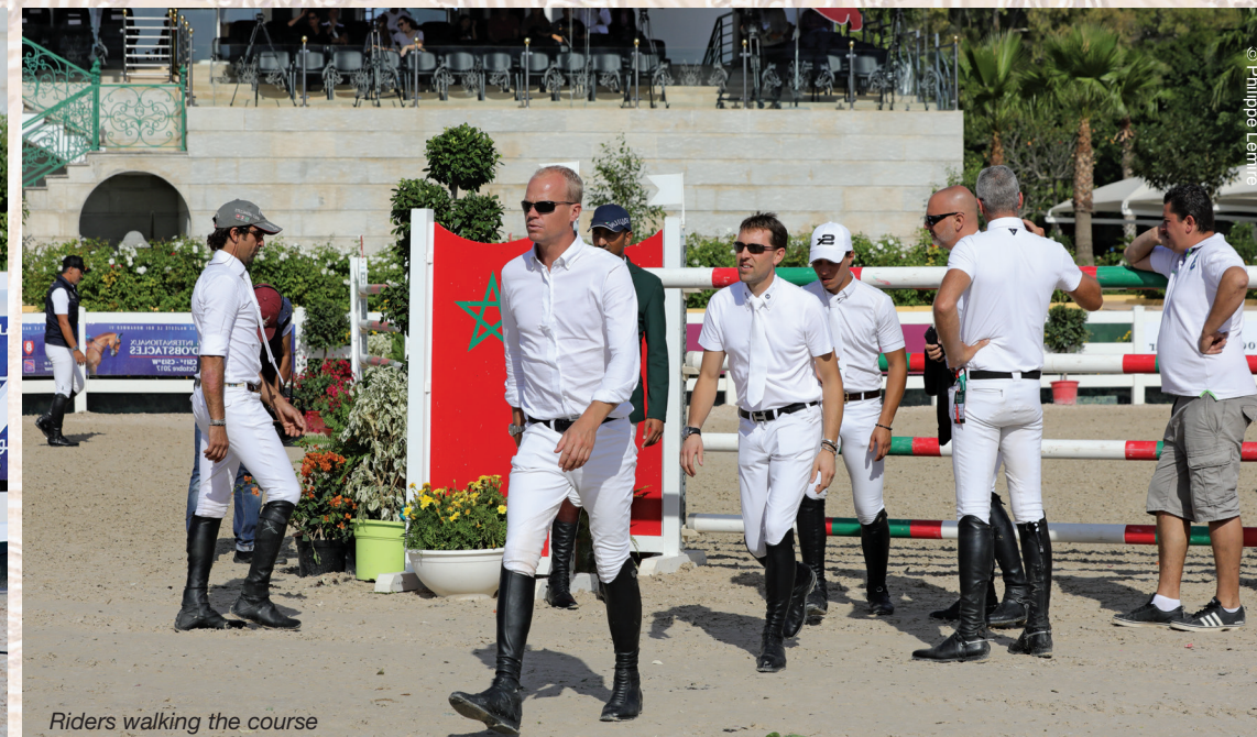
Riders walking the course