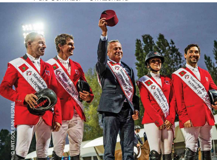
Team Switzerland - Nations Cup Winner

Eight teams made it to Rabat to take part in the competition. These teams were Belgium, The Netherlands, United Kingdom, Italy, Switzerland, Kingdom of Saudi Arabia, France and Morocco.