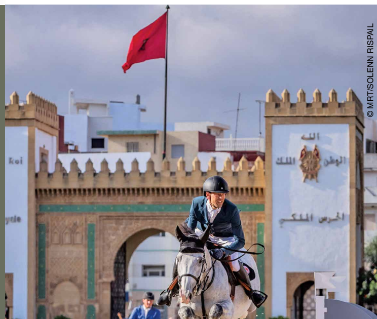
Simon Delestre - France

Only seven riders managed to finish the first round without any penalty points due to the difficulty of the