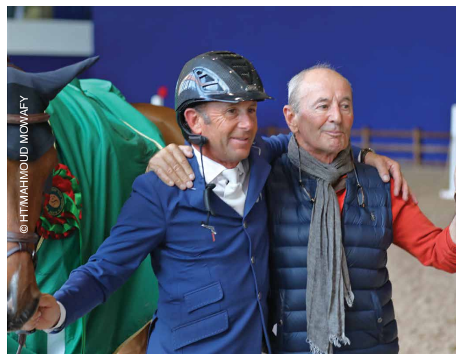
Philippe Rozier and Father Marcel Rozier - ElJadida