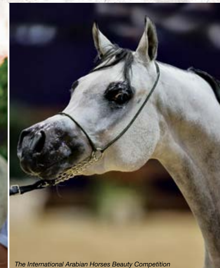
The International Arabian Horses Beauty Competition