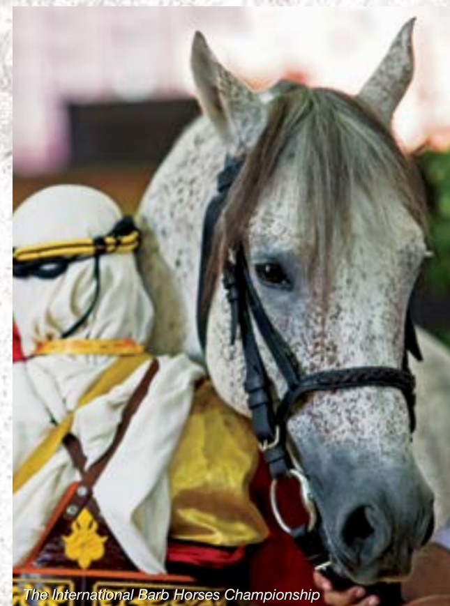
The International Barb Horses Championship

In the 9th edition of Salon du Cheval, the Arab Photographers Union holds a photography competition, with the title of "Arabian Horses" in addition to having "Tbourida" as a new attribute. Five photographers were chosen as winners during the Salon du Cheval.