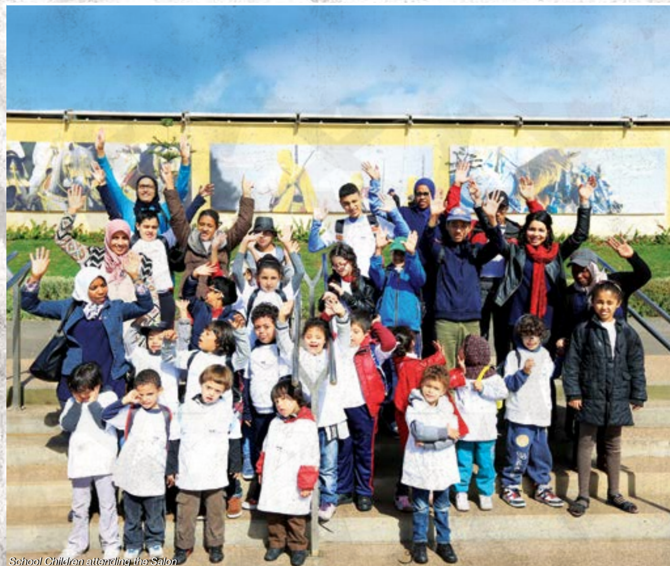
School Children attending the Salon