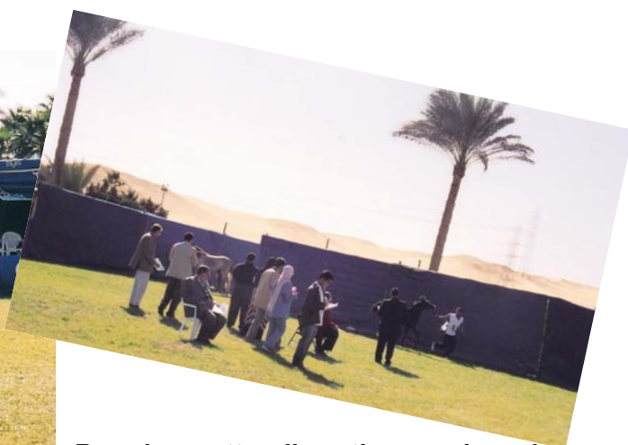
Breeders attending the seminar in Sakkara Country Club.