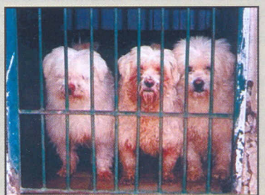
"3 Amigos". Three poodles that have spent the last 4 years! in a cage at the PDSA. They need to stay together, and nobody wants them

More information and ticket sales can be obtained from The Animal Friends office. Sponsors will be very welcome and their names included in all the advertising for the event.