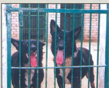
Houtshi and Blacky have been at the PDSA for more than 6 months. They are both blind, and were found wandering the streets by one of Animal Friends members

Many of the animals that we care for have suffered tremendously. Some have survived life on the streets, others had to live in harsh conditions in tiny cages, some have been horribly abused or tortured, and many were abandoned by their owners for no good reason. Overpopulation, abuse and abandonment are only a few of the many problems animals face in this country. We cannot solve all of these problems at once. But as animal lovers we feel we have to start somewhere. Animal Friends has made a head start, but we need your help to get further along on the long road to a humane existence for all animals in Egypt.