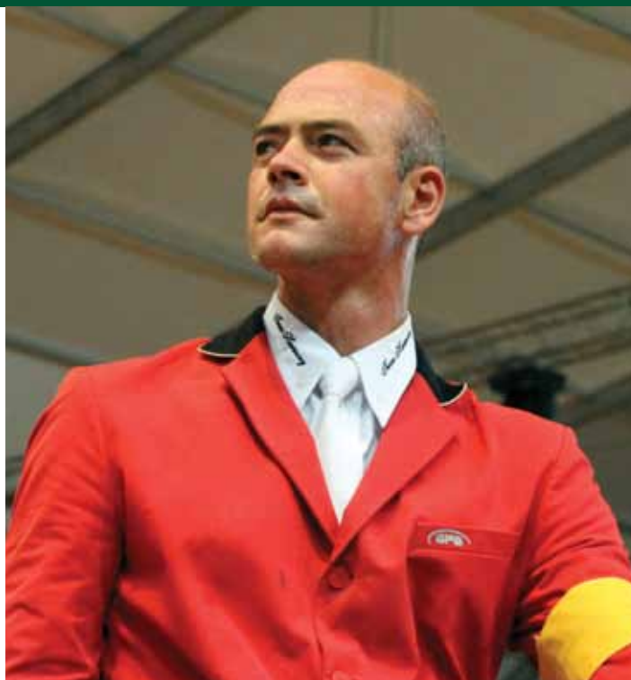
▲ During the 2011 Prize Ceremony of Salon du Cheval d'El Jadida