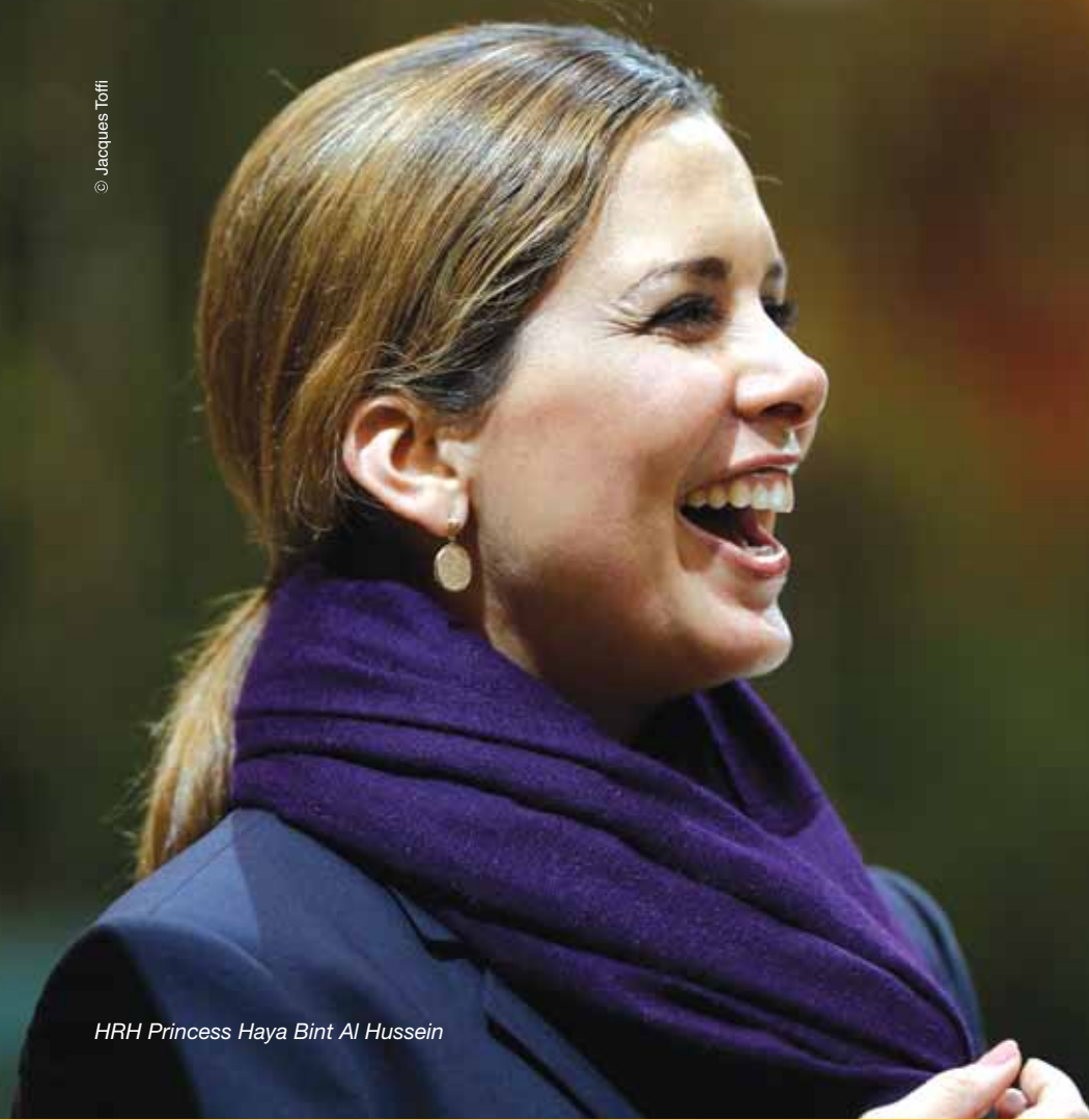
HRH Princess Haya Bint Al Hussein