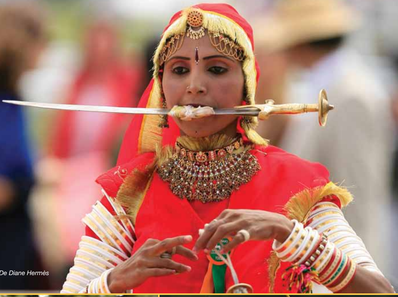
Prix De Diane Hermès