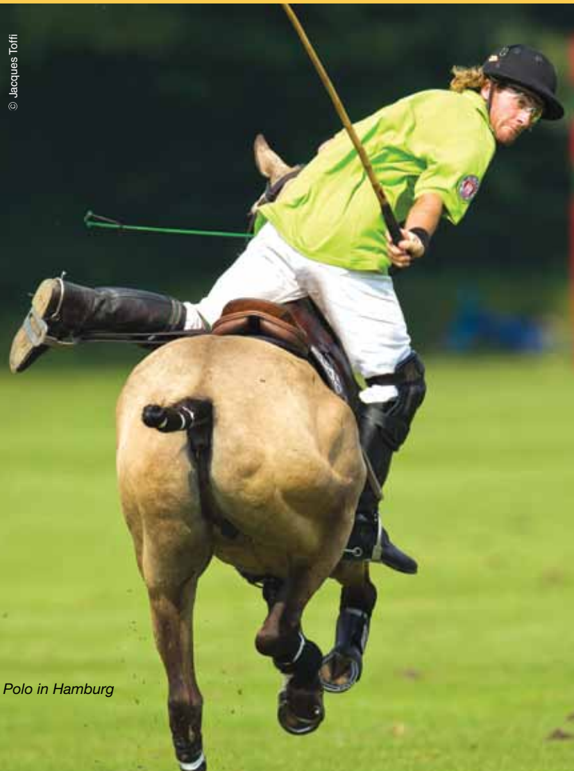
Polo in Hamburg