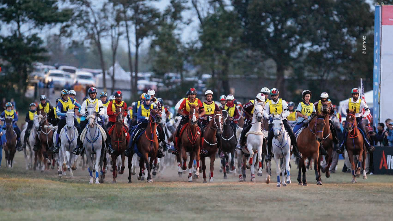
▲ Endurance Racing was dominated by the UAE that won three medals in this discipline!