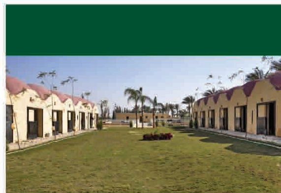
▲ El Nadim Stud