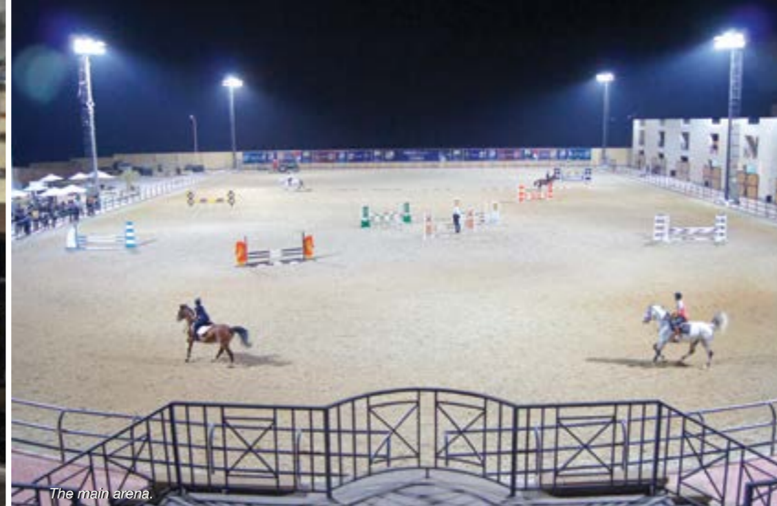
The main arena.