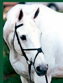
▲ Gem Twist: 'The best next to Milton'