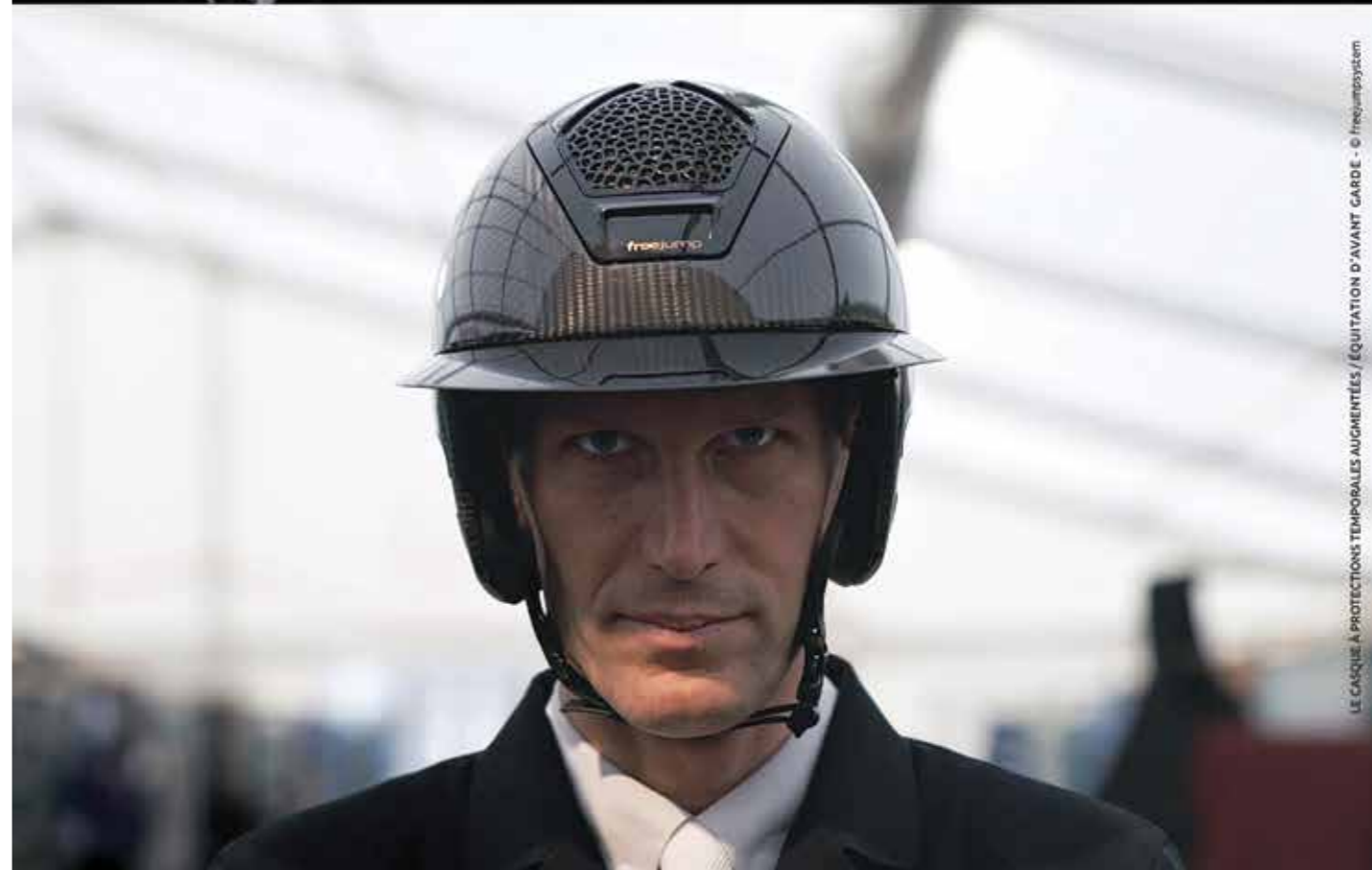
LE CASQUE À PROTECTIONS TEMPORALES AUGMENTÉES / ÉQUITATION D'AVANT GARDE - © Freejumpsystem