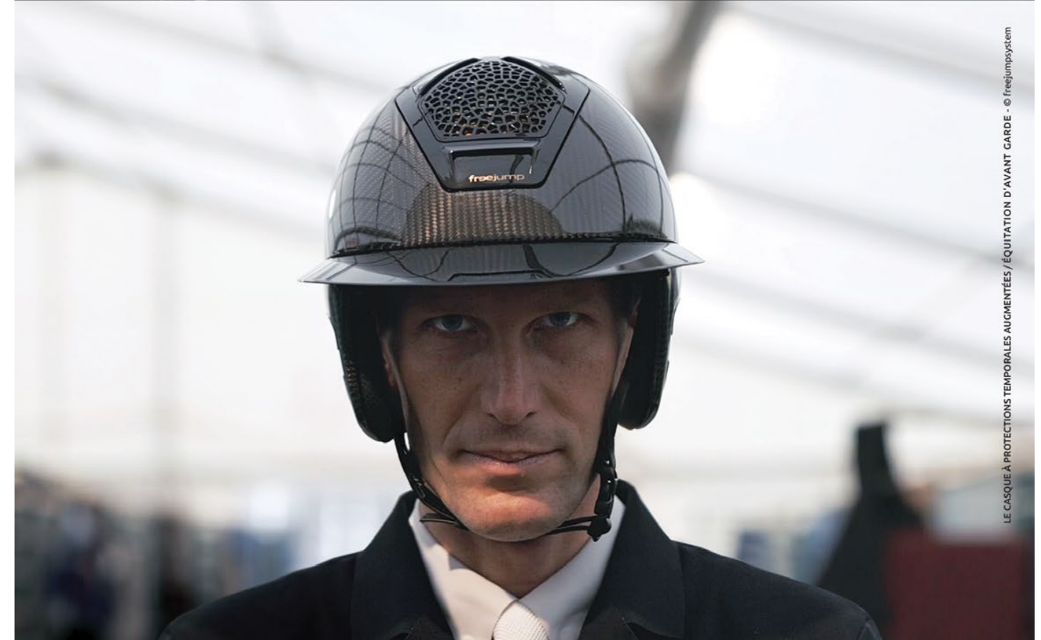
LE CASQUE À PROTECTIONS TEMPORALES AUGMENTÉES / ÉQUITATION D'AVANT GARDE