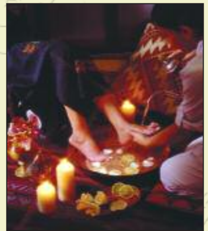
Cairo foot treatment