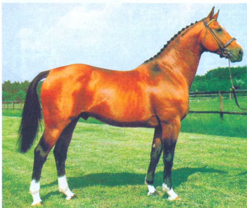
The Great Alme Z, SF 1966, by Ibrahim x Girondine by Ultimate. A true foundation sire, he has left an imprint in most European stud books. Galoubet A, I Love You, Rochet M, Baloubet du Rouet an Ratina Z.

National Breeding shows with the purpose of educating, selecting and valorizing 4, 5, 6 year old horses in the three disciplines of dressage, showjumping and eventing is being held all over the year. Breeding shows takes place in Le Pin and Fontainebleau for foals, 2 and 3 year olds and stallion licensing show in Saint Lo. Each year, young horse national finals take place in Fontainebleau for showjumping, in Pompadour for three day event and in Saumur for dressage. Selection being very much oriented towards its jumping ability, the Selle Français is a much sought after show jumping horse, in France as well as in foreign countries. Many products are exported and have joined foreign international show jumping and eventing teams. Its performances in these two disciplines enable it to be best placed for the selection indexes (Individual index and BLUP).