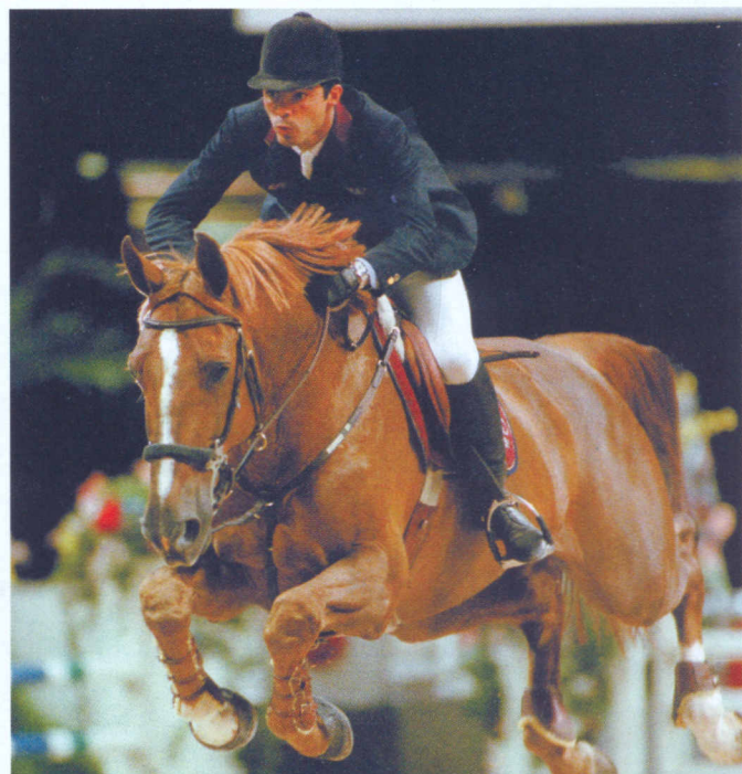
Baloubet du Rouet SF Double winner of the World Cup showjumping finals with Brazil's Rodrigo Pessoa