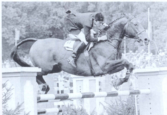
Galoubet A, Son of Alme Z and Sire of Baloubet du Rouet. It has been said "He is a horse that can jump the world"