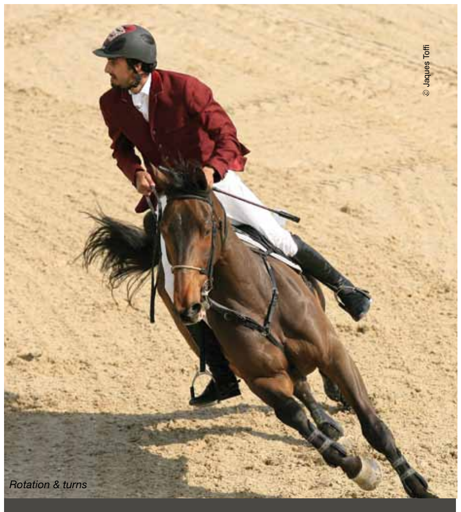
Rotation & turns

In conclusion, when jumping a full course, once the rider has fully understood the elements of speed, direction, balance and impulsion, the rider has to allow his instinct to