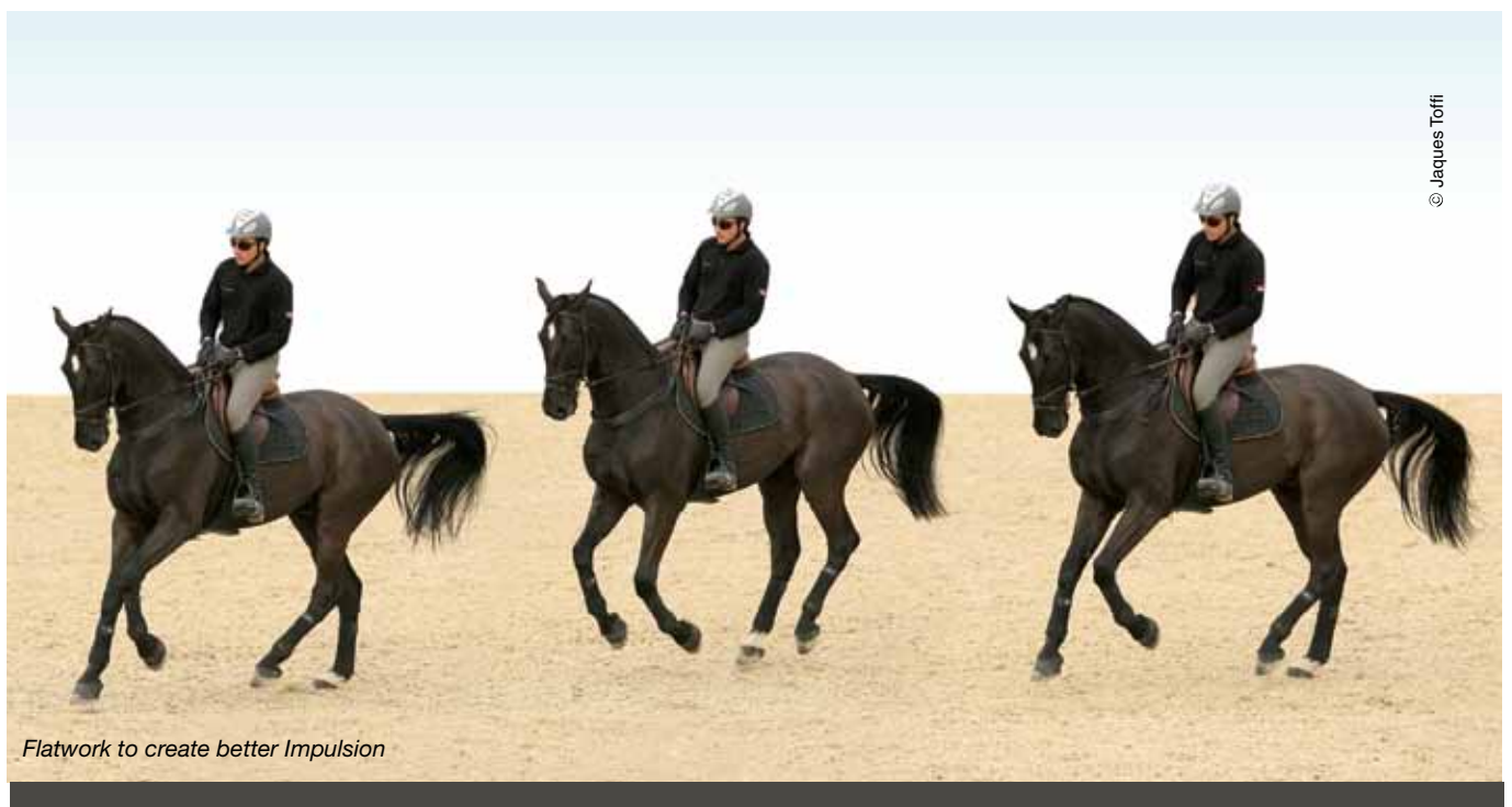
Flatwork to create better Impulsion