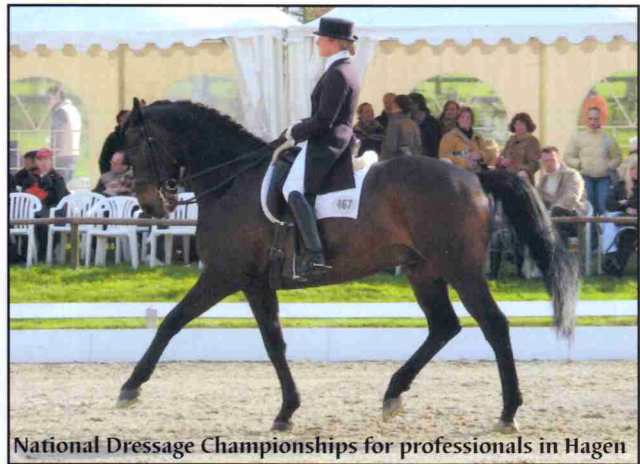
National Dressage Championships for professionals in Hagen