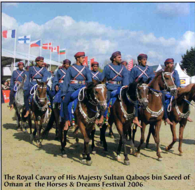
The Royal Cavary of His Majesty Sultan Qaboos bin Saeed of Oman at the Horses & Dreams Festival 2006